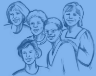
Women of the Church