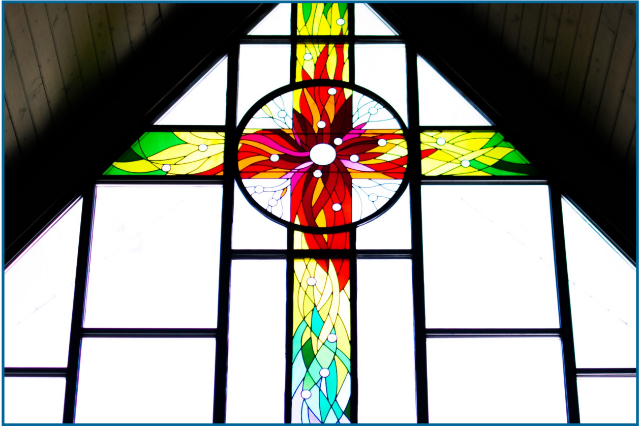
Hope Ridge window.