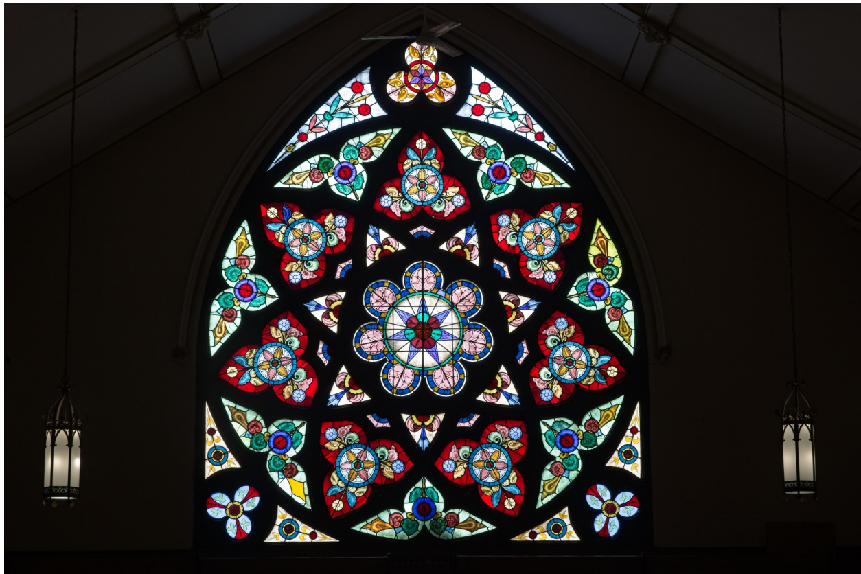
This is the Rose Window at Painesville UMC, which contains over 1300 pieces of stained glass. The window cost $300 in 1873 and was paid for by the YOUTH group!!